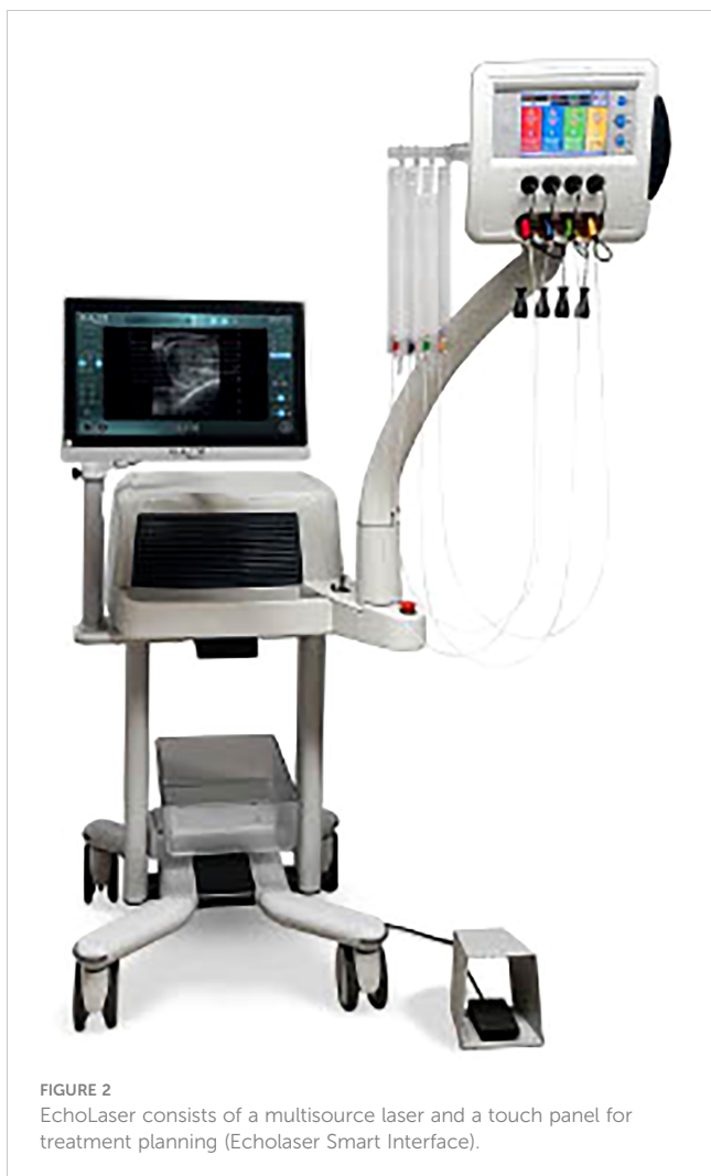
FIGURE 2 EchoLaser consists of a multisource laser and a touch panel for treatment planning (Echolaser Smart Interface).

The therapeutic process is divided into two macro-phases, each of which has been coded as follows: