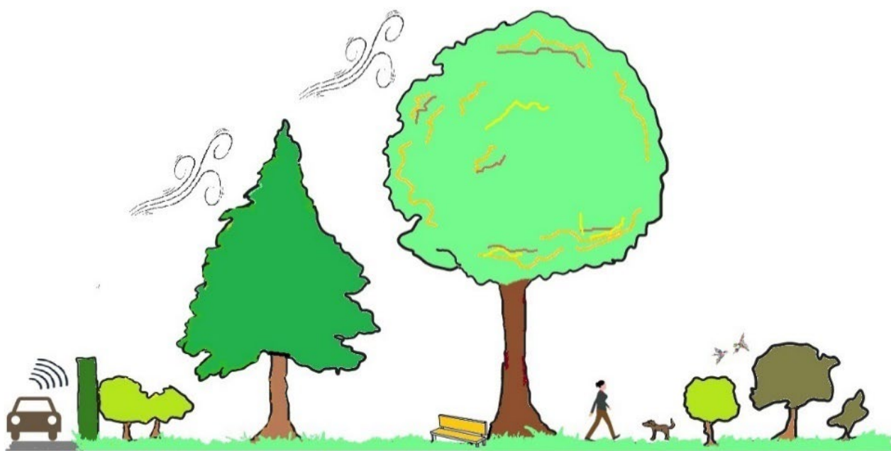
Figure 2. Ornamental plants and their potential positive effects on urban and peri-urban environments. A combination of species with vegetation from the ground can be used as noise barriers, and species with high density foliage can be used as shields for wind protection. Through their transpiration, they can reduce temperature, and with their canopy, they can create shadow areas for relaxing during the summer. Different species increase the biodiversity in urban and peri-urban areas.

Plants are key elements of rain gardens. Water cycles benefit plants through the transpiration process as well as the long-term maintenance of suitable soil structures (to increase the water infiltration) [47]. Plants also remove nutrient-based pollutants (mostly nitrogen and phosphorus) and, partially, non-biodegradable pollutants (i.e., heavy metals) in stormwater runoff [48]. The plants, also thanks to their ornamental features, enhance the aesthetic value of the landscape [49].