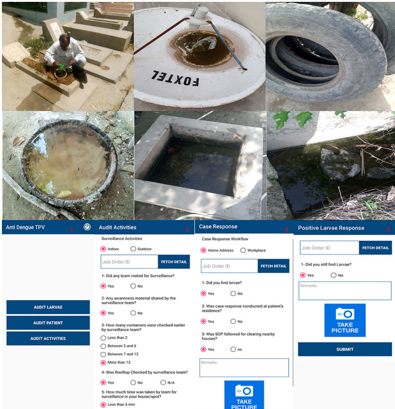
Fig.1. Hotspots investigation and system information questionnaire (Fig.1. First section displays different larval investigation hotspots, and its second section displays an information questionnaire on the Anti-Dengue Android Application System)

Figure 2. Investigation and system information questionnaire. The first section displays different larval investigation containers, while the second section presents an information questionnaire on the anti-dengue android application system; (1) Dengue mobile app dashboard: Offering various larval audit options such as Audit larvae, Audit patient, and Audit activities, teams selected audit options based on the situation of surveillance containers. (2) Audit activities: For example, the TPV Team selected this option and encountered this interface, where they input the required information and submitted it. (3) Audit patient: Patients were observed during surveillance, and their data were submitted to maintain a history. (4) Audit larvae: The TPV team had to submit information on larvae observed during surveillance.