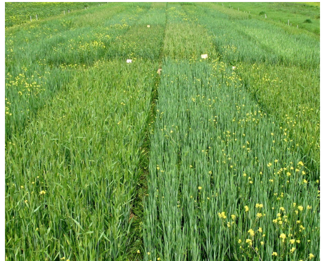
Fig. 1 Cultivar evaluation trials embedded in organic and low-input cropping systems: the first step to improve organic and low-input wheat growing.

The aim of this paper is to show that a trait-based functional categorization of agrobiodiversity can better highlight those approaches and solutions that are more likely to improve the sustainability of wheat production.